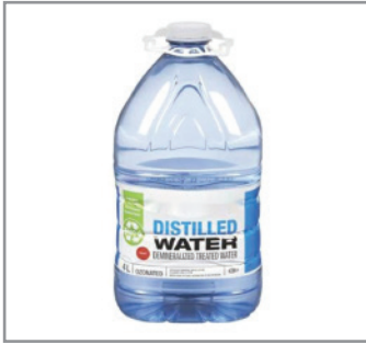
Distilled Water 4L PS4393