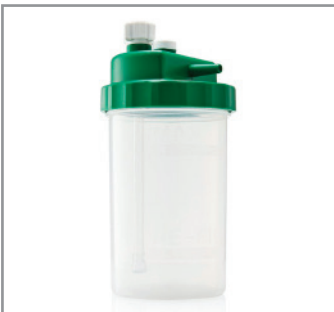
Large Volume Nebulizer Bottle PE8163