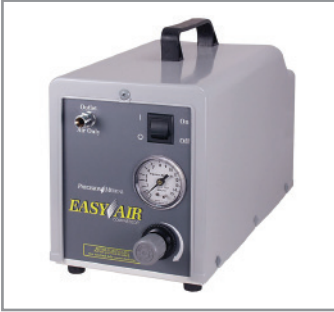
Humidity Compressor *Must order kit separate PE8154