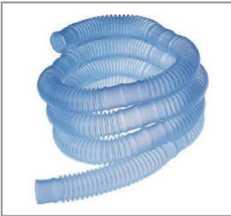
Corrugated Tubing PS4177