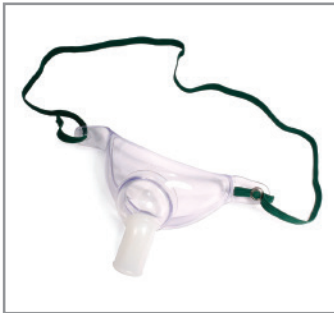
Trach Mask Adult PS4390 Pediatric PS4392